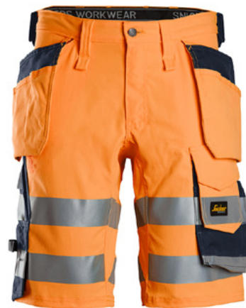
Shorts class 1