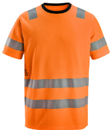
T-shirts and sweatshirts