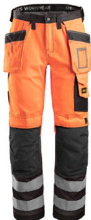
Pants class 2