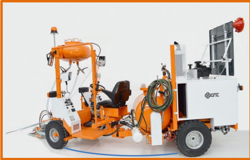
Photo doesn't show standard machine.

Dimensions: 345x110x h without warning board 210 cm; Weight: 1300 Kg